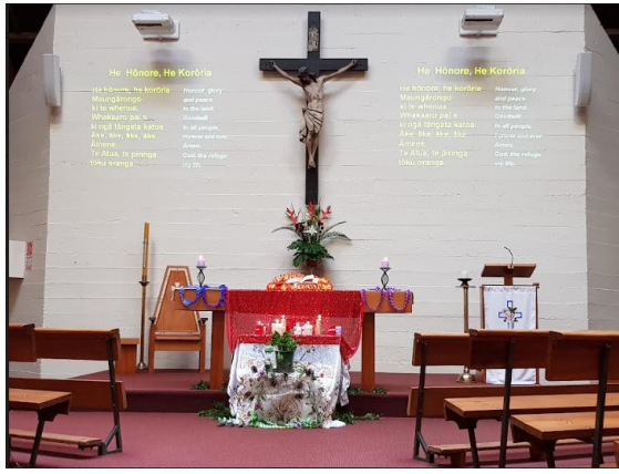
Divine Mercy Prayers Sunday July 3rd after 5pm Mass

Last weeks Matariki celebration at St Anne's was a time for remembrance joy and peace. Thank you to everyone who helped us to celebrate this occasion.