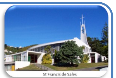
St Francis de Sales

Parish Office: 22 Emmett Street Newtown Telephone - 934 4099; office@wellingtonsouthcatholic.org; Web Site: https://wellingtonsouthcatholic.org