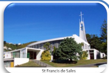
St Francis de Sales

Telephone - 934 4099; office@wellingtonsouthcatholic.org ; Web Site: https://wellingtonsouthcatholic.org