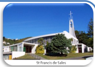
St Francis de Sales

Parish Office: 22 Emmett Street Newtown Telephone - 934 4099; office@wellingtonsouthcatholic.org ; Web Site: https://wellingtonsouthcatholic.org