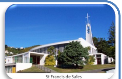
St Francis de Sales

Telephone - 934 4099; office@wellingtonsouthcatholic.org ; Web Site: https://wellingtonsouthcatholic.org