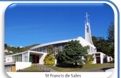
St Francis de Sales

Parish Office: 22 Emmett Street Newtown Telephone - 934 4099; office@wellingtonsouthcatholic.org ; Web Site: https://wellingtonsouthcatholic.org