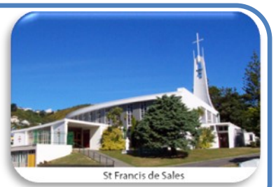
St Francis de Sales

Telephone - 934 4099; office@wellingtonsouthcatholic.org ; Web Site: https://wellingtonsouthcatholic.org