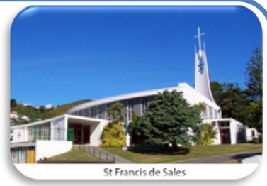
St Francis de Sales

Telephone - 934 4099; office@wellingtonsouthcatholic.org ; Web Site: https://wellingtonsouthcatholic.org