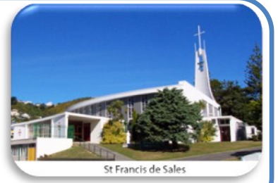
St Francis de Sales