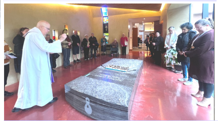
A Parish Anointing Mass at the Home of Compassion was held on Thursday 3rd October. Remembering the Anniversary of Venerable Suzanne Aubert's death.

Calling all teens and young adults! Join us for the last two XLT (eXaLT) worship nights of the year! XLT is a night of fellowship, prayer, food, live praise & worship, Reconciliation and Eucharistic Adoration, all centred around a theme and aimed at college students and young adults. Join us at 7pm on Friday, 18th October and 29th November, in St Anne's Hall , Emmett Street, Newtown.