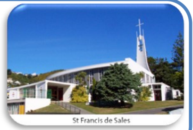
St Francis de Sales

Parish Office: 22 Emmett Street Newtown Telephone - 934 4099; office@wellingtonsouthcatholic.org ; Web Site: https://wellingtonsouthcatholic.org