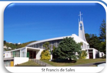
St Francis de Sales

Parish Office: 22 Emmett Street Newtown Telephone - 934 4099; office@wellingtonsouthcatholic.org ; Web Site: https://wellingtonsouthcatholic.org