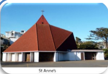
St Anne's Telephone - 934 4099;